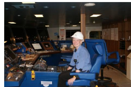
Amber Thinks She's In The Driver's Seat – WRONG!