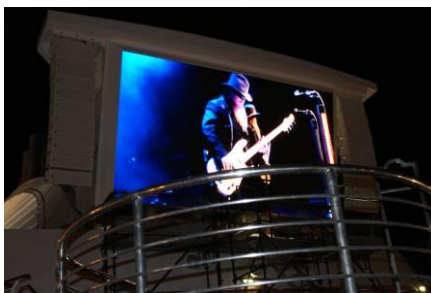
ZZ Top Live at Commissioning