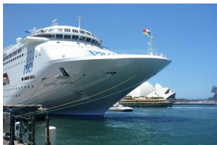
Pacific Jewel – Window Cleaning by Abseiling on the Dome