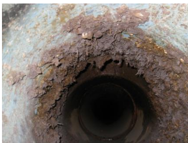
What is it? Inside the old seawater pipe at AMP.