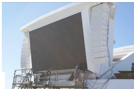
7m x 7m MUTS Movie Screen

Having recently successfully installed air conditioning into the Dawn Princess and a US$1 million MUTS (Movie Under The Stars) screen, Inter-Marine is looking forward to being involved with another three similar installations in 2010 as part of the Carnival/Princess roll-out.