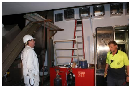
MUTS Team Hard at Work in Brisbane Dry Dock