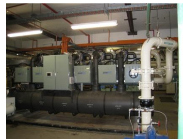
New 2300 kW Chiller 1 at AMP

We installed some condensing sets and other types of equipment as well. At AMP Sydney Cove we replaced the 40 year old seawater pipe system with ABS which included night works under water in the harbour using divers and much of it was learn as you go. We then added a new DDC system to control the entire chilled water producing plant. Total project value was around $1,500,000.